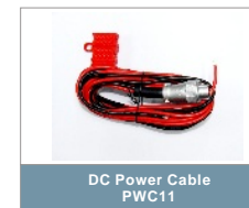
DC Power Cable PWC11