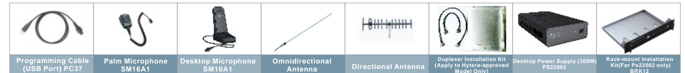
Programming Cable (USB Port) PC37